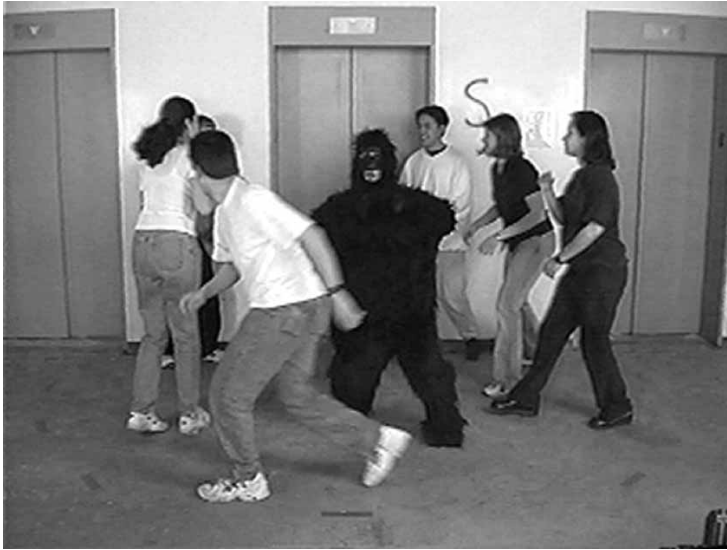
Figure 3. A single frame from an additional experimental condition in which the gorilla stopped in the middle of the display, turned to face the camera, thumped its chest, and then continued walking across the field of view. Subjects performed the Easy monitoring task while attending to the White team, and the noticing rate was similar to that in the corresponding condition with the standard (shorter) Opaque/Gorilla event.

Twelve new observers (6) watched this video while attending to the White team and engaging in the Easy monitoring task; only 50% noticed the event. This is roughly the same as the percentage that noticed the normal Opaque/Gorilla-walking event (42%) under the same task conditions.