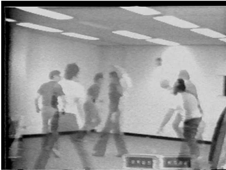
Figure 1. A single frame captured from a late-generation video of the umbrella-woman sequence used by Neisser and colleagues (eg Neisser 1979). The woman is in the center of the image and her umbrella is white.

In subsequent studies of selective looking, Neisser and his colleagues used this 'basketball-game' task [see Neisser (1979) for a description of several different versions]. In the most famous demonstration, observers attend to one team of players, pressing a key whenever one of them makes a pass, while ignoring the actions of the other team. After about 30 s, a woman carrying an open umbrella walks across the screen (this video was also superimposed on the others so all three events were partially transparent; see figure 1). She is visible for approximately 4 s before walking off the far end of the screen. The games then continue for another 25 s before the tape is stopped. Of twenty-eight naive observers, only six reported the presence of the umbrella woman, even when questioned directly after the task (Neisser and Dube, cited in Neisser 1979). Interestingly, when subjects had practice performing the task on two similar trials before the trial with the unexpected umbrella woman, 48% noticed her. When subjects just watched the screen and did not perform any task, they always noticed the umbrella woman, a result consistent with the inattentional-blindness findings reviewed earlier (and with work on saccade-contingent changes; see Grimes 1996; McConkie and Zola 1979).